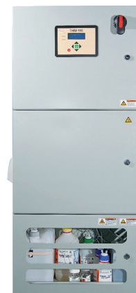
Aqua Metrology Systems THM-100™

The online THM-100 analyzer is based on the 100-year old Fujiwara reaction specific for THM detection. However, the methodology has been modified to allow for robust and reproducible analysis, inclusive of THM speciation via an instrument that does not require operation by a skilled technician.